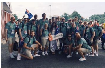
The AUS Team at the Opening Ceremony

Overall, it was a fantastic Games with terrific performances and enough joy, tears, laughter and friendships to last for life.