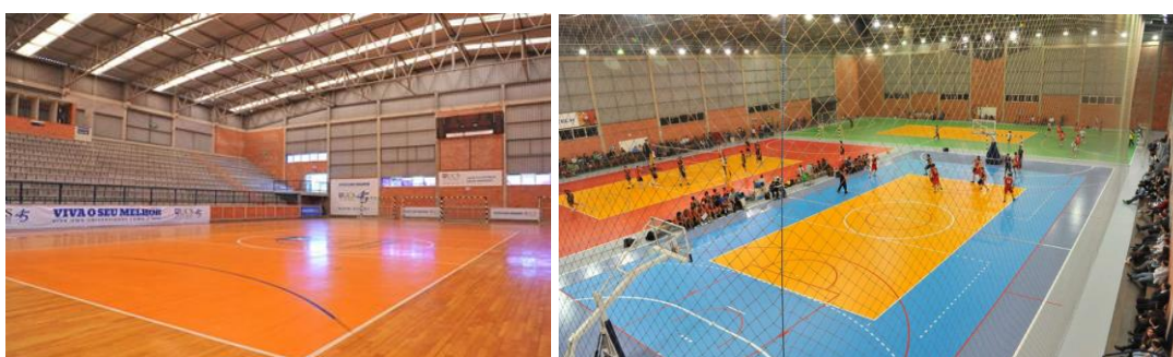
Figure 5 - Gymnasiums of the Multisport Village

The University of Caxias do Sul has hosted other events of Sports for the Deaf at Municipal, State, National and International levels. Highlighting championships already held in Caxias do Sul: