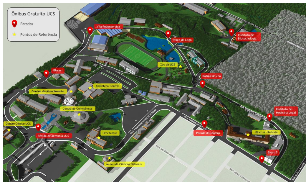
Figure 3 - Map of the University of Caxias do Sul