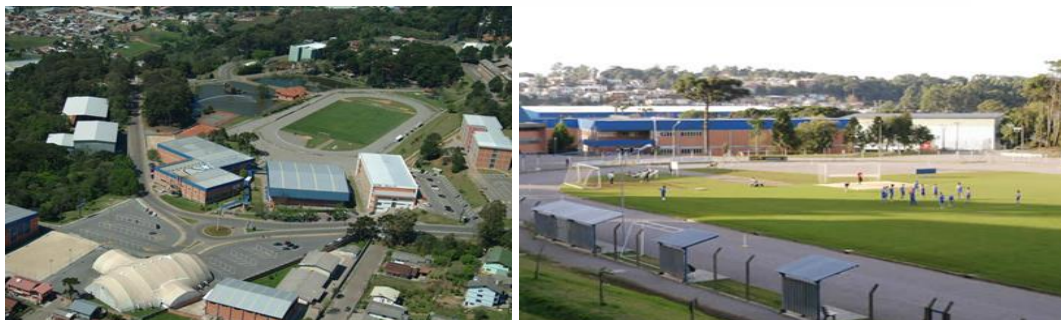
Figure 4 - Multisport Village (Vila Poliesportiva)