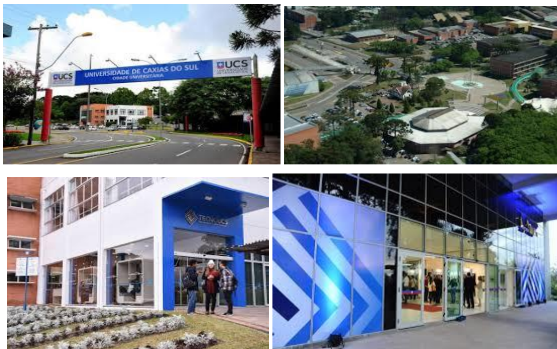
Figure 2 - University of Caxias do Sul

We highlight the infrastructure and technical capacity of the University of Caxias do Sul, which today occupies a prominent place in Higher Education in Brazil, being the 6th best private and community institution, the 1st placed in innovation and the 9th in research, according to Ranking Universitário Folha (RUF) 2018. In 2019, UCS was ranked as one of the best universities in the world by the British magazine Times Higher Education and has been a partner of the State and of the Federal Government in many development projects. UCS since its creation in 1967, seeks to continuously promote a scientific, technical and humanist education, with a view to the full education of its students and the economic and social development of the northeast region of Rio Grande do Sul. At the moment UCS has 20,000 students and offers 151 undergraduate courses in classroom and distance learning covering all areas of knowledge. In the area of Stricto Sensu Graduate Studies, UCS has 29 courses, 18 master and 11 doctorate courses. All this makes UCS the largest Community Higher Education Institution in the State of Rio Grande do Sul. The University also has a Science, Technology and Innovation Park (TecnoUCS), which promotes the advance of culture, research, innovation and entrepreneurship.