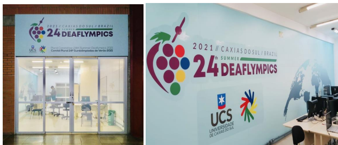
Figure 6 - Plural Committee Room

With regard to Deaflympics, UCS, within its attributions, committed and dedicated, carefully made its sports equipment available and structured the work room for the Plural Committee (Figure 6).